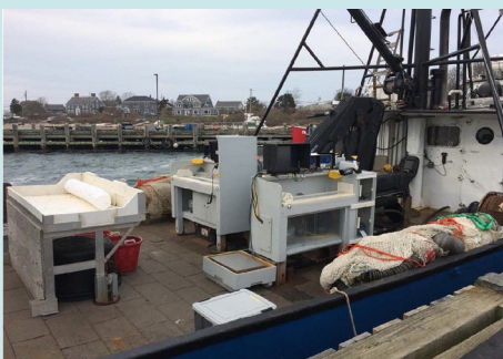
The checker (left) and sampling stations are ready to go aboard the R/V Gloria Michelle in early May, prior to the start of the Massachusetts groundfish survey.