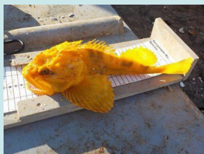
Unusual yellow sea raven photographed by a Northeast fishery observer while sampling catch aboard a commercial fishing vessel. Photo credit: NOAA Fisheries/NEFSC/NEFOP