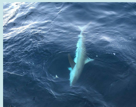
A dusky shark on the line before being brought aboard for tagging and later release during the NEFSC's coastal shark bottom longline survey.