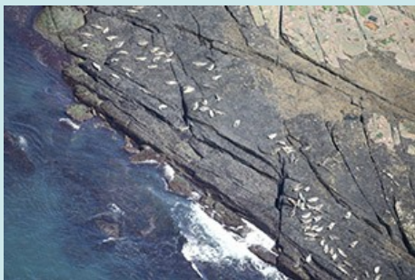
Dozens of harbor seals are visible on this rocky ledge, typical of areas where the seals haul out in Maine.