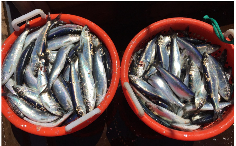
Atlantic herring.

In a separate action related to the Omnibus Industry-Funded Monitoring (IFM) Amendment, the Council voted to support the use of electronic monitoring (EM), coupled with portside sampling, as an adequate substitute for at-sea monitors aboard Atlantic herring midwater trawl vessels. The Council also supported