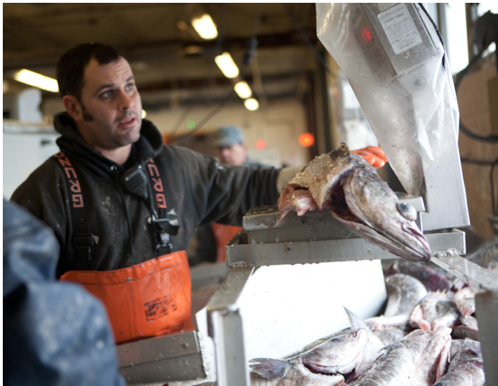
Weighing the catch.