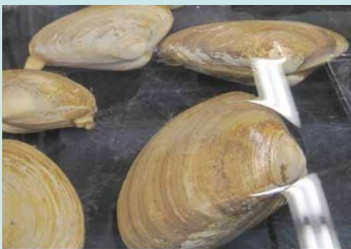
Surfclams in a joint study by NEFSC and the Woods Hole Oceanographic Institution on ocean acidification effects.

The working groups are proceeding with meetings to consider data, modeling, and biological reference points, the peer review will occur Nov. 29-Dec. 2 in Woods Hole MA. Details are here: http://www.nefsc.noaa.gov/saw/