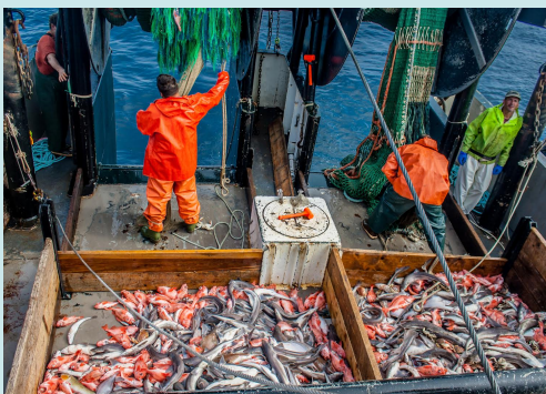
Gear efficiency study, F/V Karen Elizabeth.

The 2016 survey is complete, including all pre-selected stations and additional sampling in strata of interest.