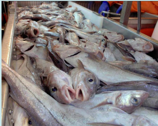
Haddock on conveyor for sorting and sampling aboard the NOAA Ship Henry Bigelow