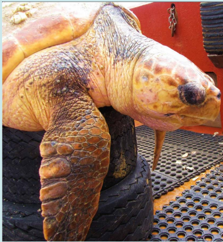
A loggerhead turtle awaiting its satellite tag. The turtle was placed on tires for cushioning. Photo Credit: NOAA Fisheries/ Heather Haas, ESA Permit 16556