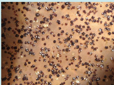
Genetically marked bay scallops cultured at NEFSC Milford Lab and planted off Cape Cod