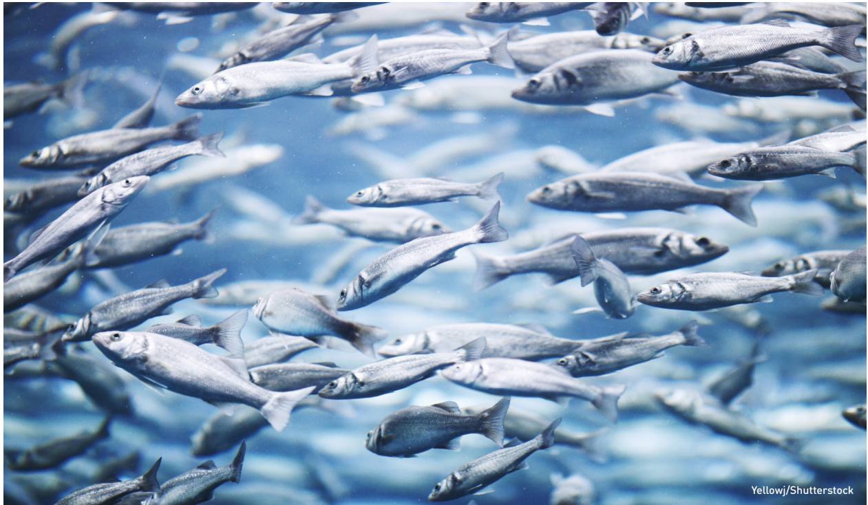
A school of mackerel.

The full report and a companion Implementation Volume providing extensive guidance on developing FEPs are available at www.LenfestOcean.org/EBFM .