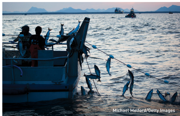
Salmon fishing in Alaska (top). Male sea lions in Newport, Oregon, at the Historic Newport Docks (bottom left). Driftnet fishing for sockeye salmon along the Nushagak River, Alaska (bottom right).