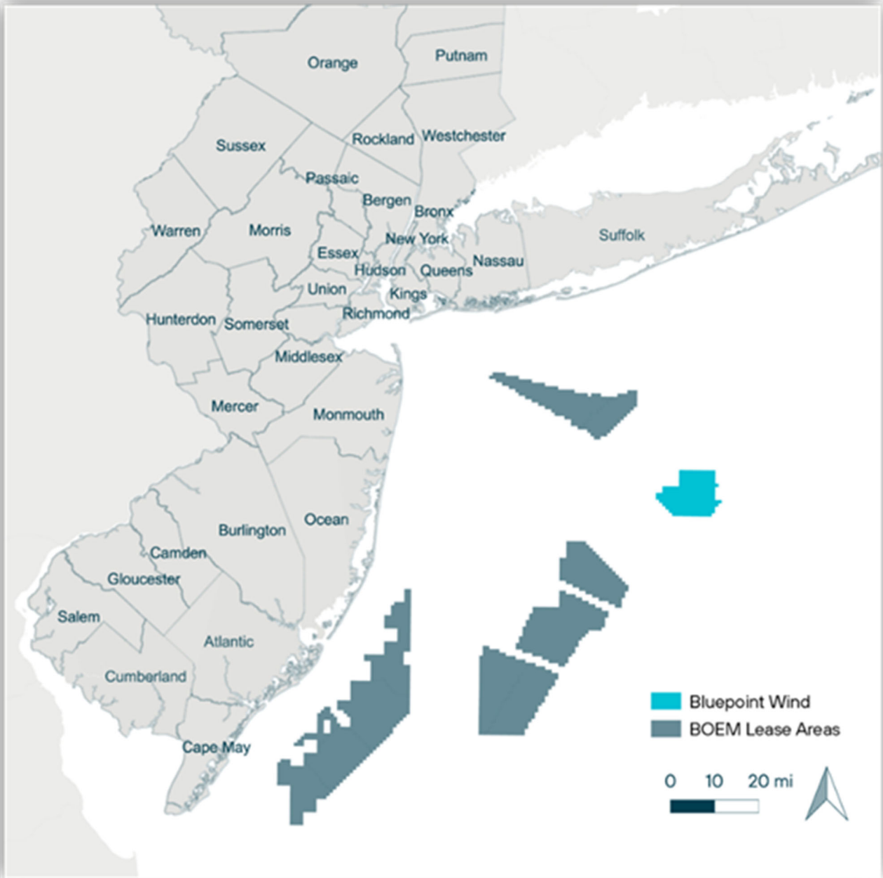
Figure 1. Bluepoint Wind Lease Area (OCS-A 0537)