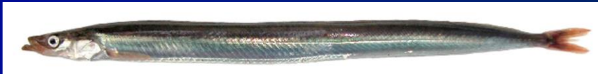
Sand Lance (Department of Fisheries and Oceans Canada)