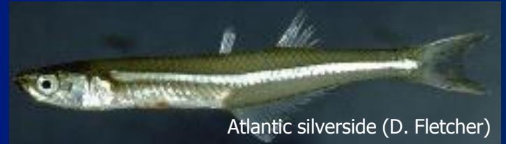
Atlantic silverside (D. Fletcher)