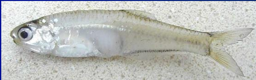
Bay anchovy