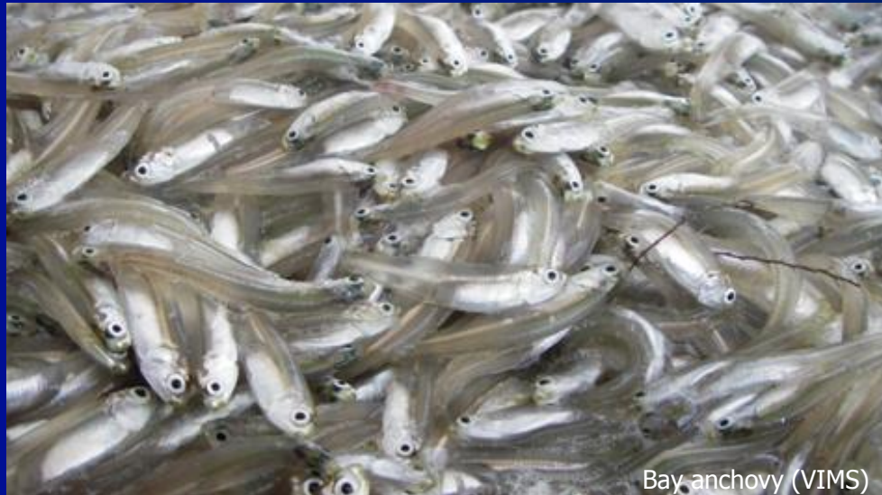
Bay anchovy (VIMS)